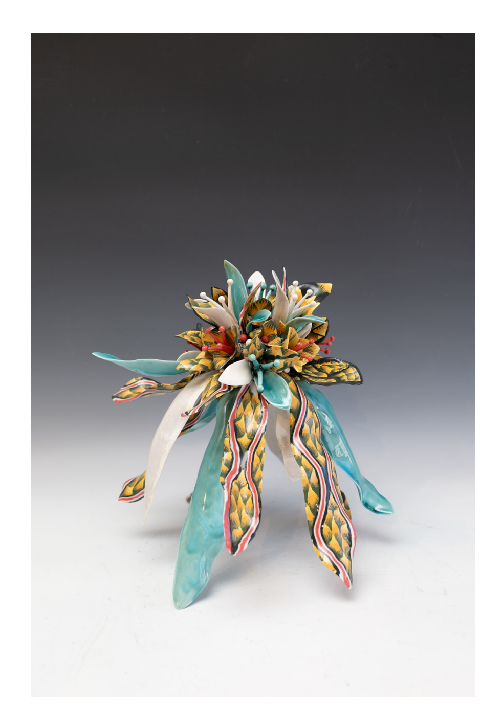
Aya Murata From the series "In Bloom", 2023 Ceramic with Clear Glaze 13.58h x 13.58w x 14.57d in

Please email info@lucylacoste.com for high resolution images and additional information. https://www.lucylacoste.com/exhibitions