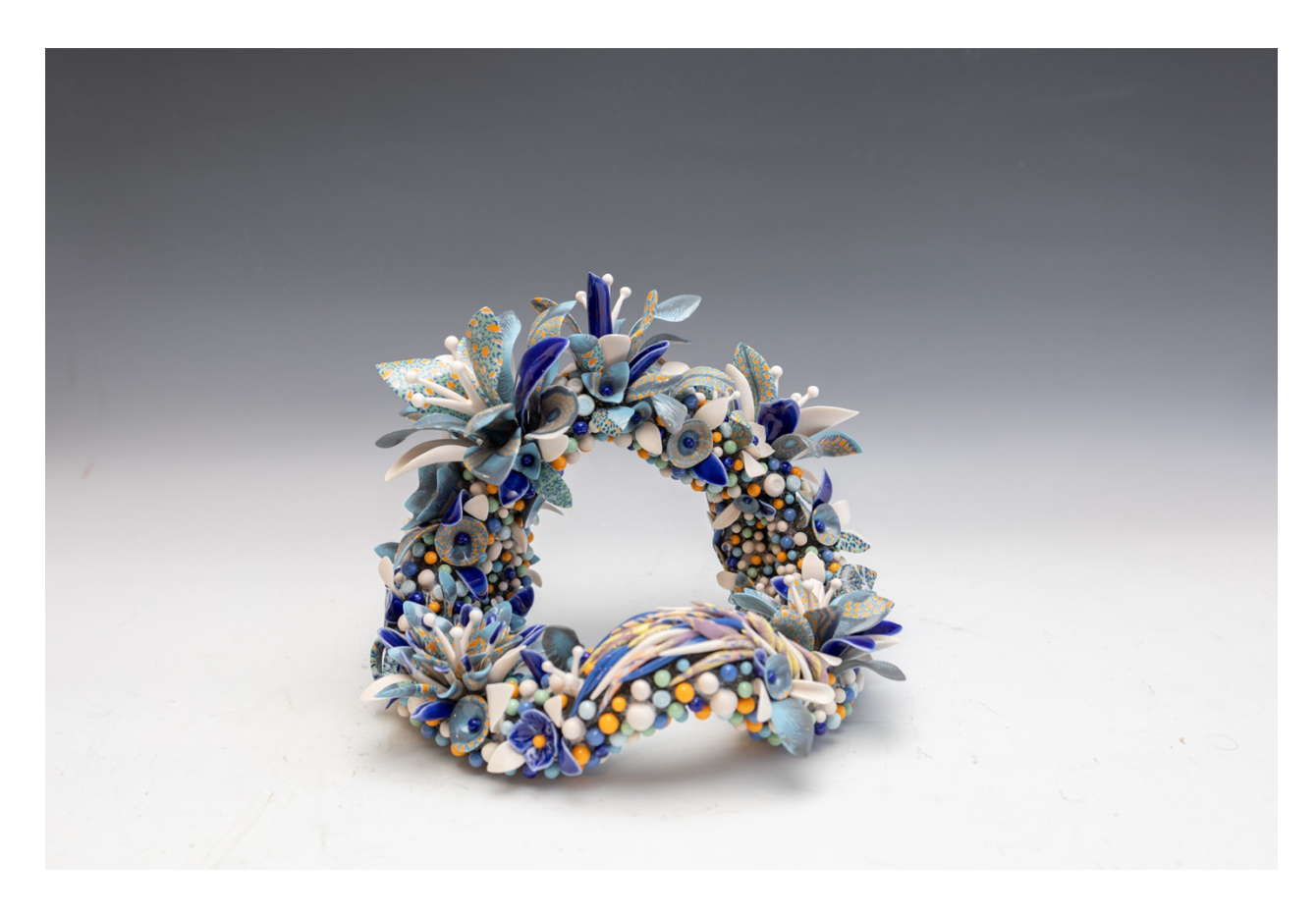
Aya Murata Garden of Blue, 2023 Ceramic with Clear Glaze 9.25h x 11.81w x 10.04d in

Please\ email\ info@lucylacoste.com\ for\ high\ resolution\ images\ and\ additional\ information. \\ \underline{https://www.lucylacoste.com/exhibitions}