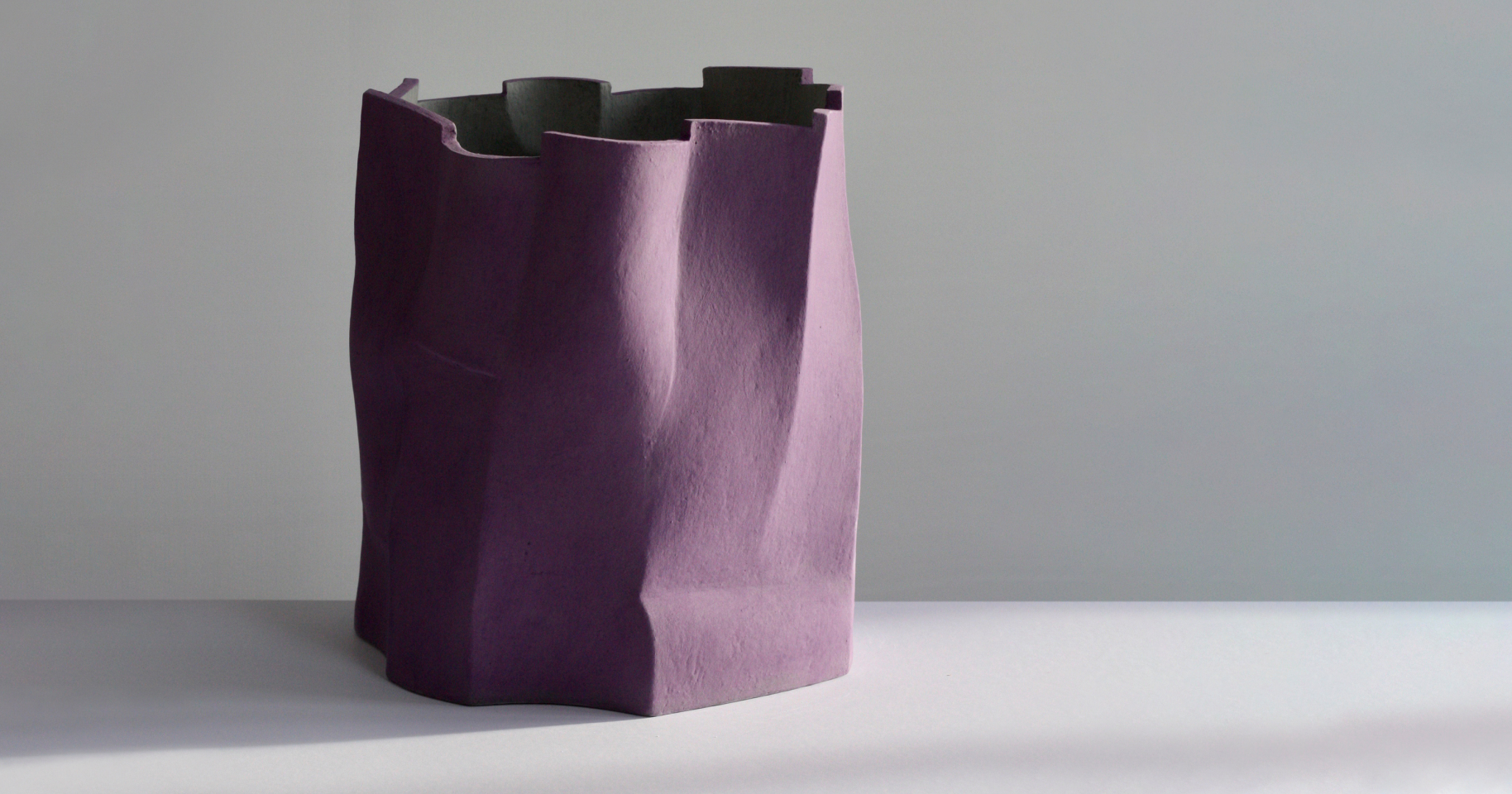
Ken Eastman Rootie Tootie, 2020 11h x 9.75w in