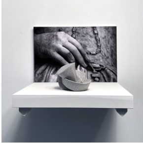
The Necklace. 2022. 15 ¼ x 18 x 14 ¾ inches

B&W photo: Jeanne d'Albert. Queen of Navarre. 1528-1572.