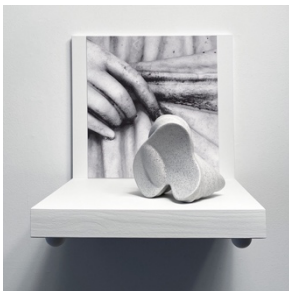
The Folds. 2022. 17 x 16 x 14 ¾ inches

Ceramics object: Clay slab construction with extrusion. Glazed.