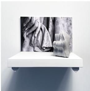
The Ring. 2022. 15 ¼ x 18 x 14 ¾ inches

Ceramic object: Clay slab construction. Glazed.