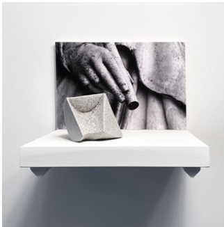
The Scepter. 2022. 15 ¼ x 18 x 14 ¾ inches

Ceramic object: Altered wheel-thrown cylinder with clay slabs. Glazed.