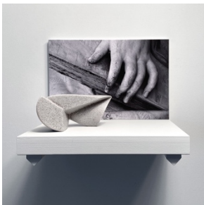
The Book. 2022. 15 ¼ x 18 x 14 ¾ inches

Ceramic object: Altered wheel-thrown cylinder with clay slabs. Glazed.