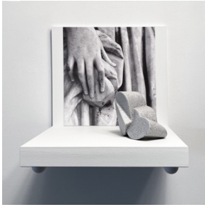
The Cloak. 2022. 17 x 16 x 14 ¾ inches

B&W photo: Marie Stuart. Queen of France. 1542-1587.