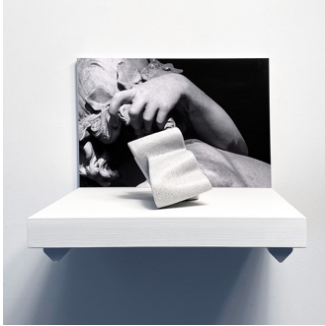
The Embrace. 2022. 15 ¼ x 18 x 14 ¾ inches

B&W photo: The Medici Fountain. Jardin du Luxembourg,