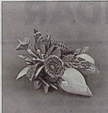
Aya Murata's "In Bloom No. 1"